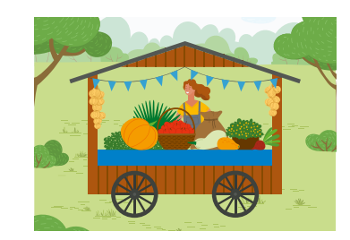
increased the number of locations the venue serves